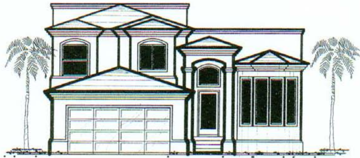
FRONT ELEVATION LIVING AREA : 2004 S.F.