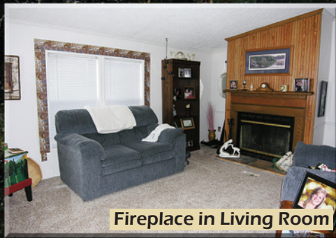
Fireplace in Living Room