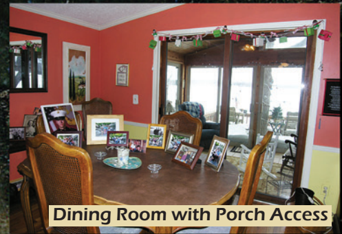
Dining Room with Porch Access