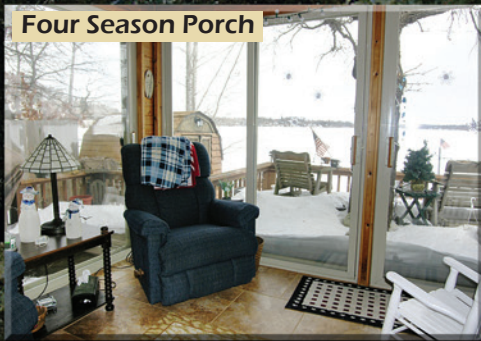
Four Season Porch