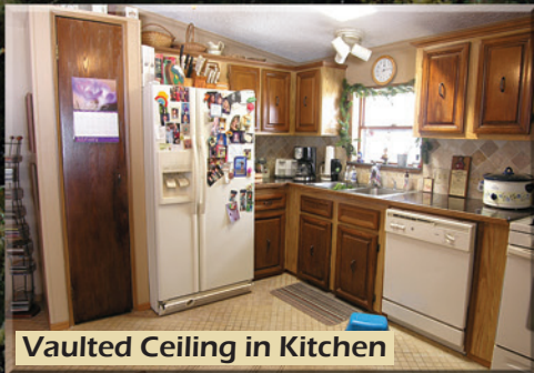
Vaulted Ceiling in Kitchen