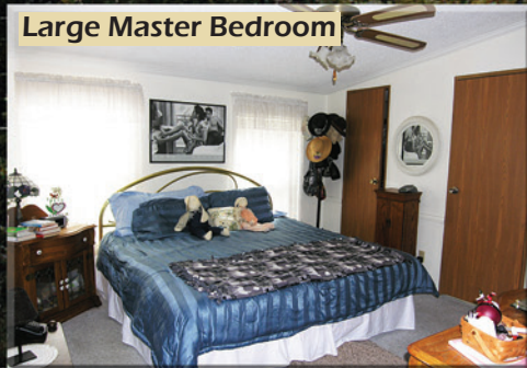
Large Master Bedroom