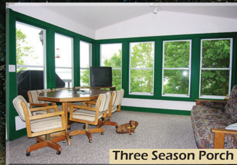
Three Season Porch