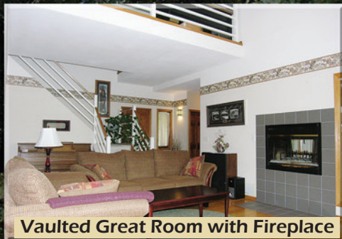
Vaulted Great Room with Fireplace