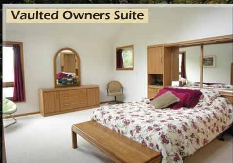
Vaulted Owners Suite