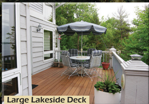
Large Lakeside Deck